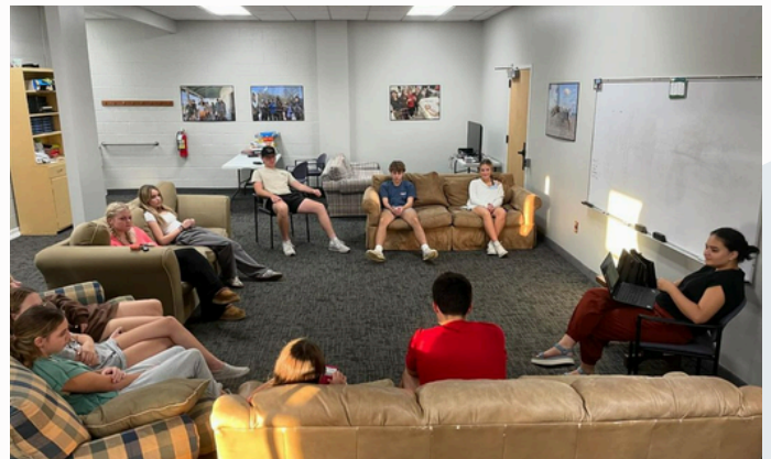
High School Bible Study

High School meet in Youth Room at 5:00 Middle School on third floor Bradley from 5:00-5:40 then Free time in Bradley until dinner Dinner in Bradley at 6:00 Games and group activities from 6:15-7:00