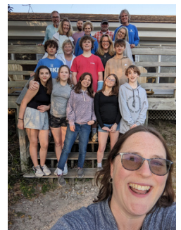
Confirmation Retreat, March 2024

their homes and guidance of their parents, but there are other factors needed: water, air, and sunshine are essential and will help the seeds grow and flourish, like friends, church, and mentors who help teach and guide the confirmands. The confirmands' journeys of introspection and growth in their Christian faith is a joy to behold, and we are grateful to be a part of it! It is refreshing to witness young adults as they grow in knowledge and faith, like flowers seeking the Son!