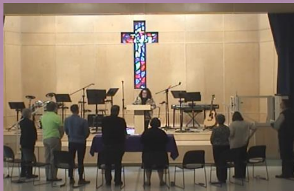
Live-streamed worship on March 15, 2020

Highland is following guidance from state and federal officials, as well as the guidance of our Bishop and Conference leadership. Most on-campus meetings and activities have been suspended at this time. If you have questions about a particular ministry or activity, please reach out to its leader or the associated staff person.